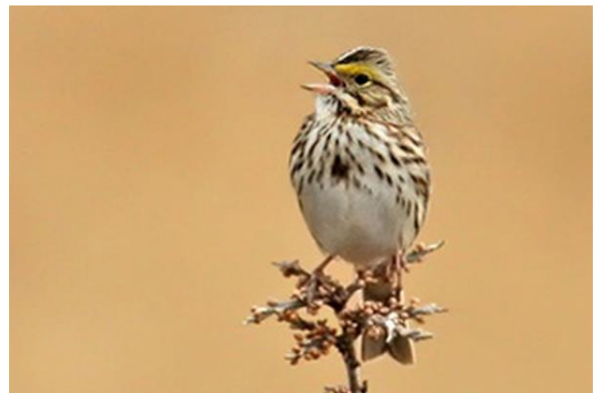
Savannah Sparrow.

Nest observations collected through the NestWatch program help scientists follow the health of bird populations through long-term monitoring of nesting activity. Birds are great indicators of the condition of their habitats, and NestWatch data provide valuable information on changes in the environment, as well as shifts in nest timing due to climate change. Participation in Project NestWatch is fun, easy, and free! After reading about how to minimize disturbance to nesting birds, you will be able to safely record the location and breeding activity of any nests you find, and submit your data online. For more information about this program, visit the BSC website ( http://www.birdscanada.org/volunteer/pnw ) or email projectnestwatch@birdscanada.org .