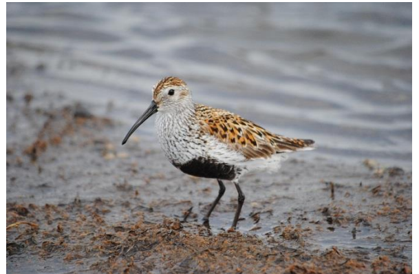
Dunlin.