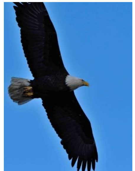
From left to right : Tree Swallow, male Wood Duck, and Bald Eagle.