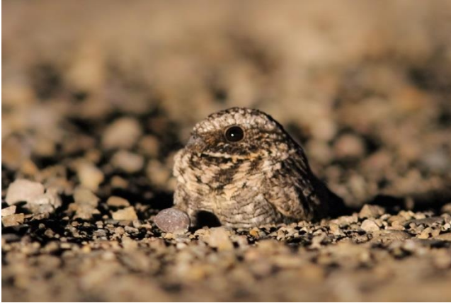
Common Poorwill.

Bird Studies Canada is looking for volunteers for the following programs: Nightjar Survey, Breeding Bird Survey (BBS), Canadian Lakes Loon Survey, and Project NestWatch.