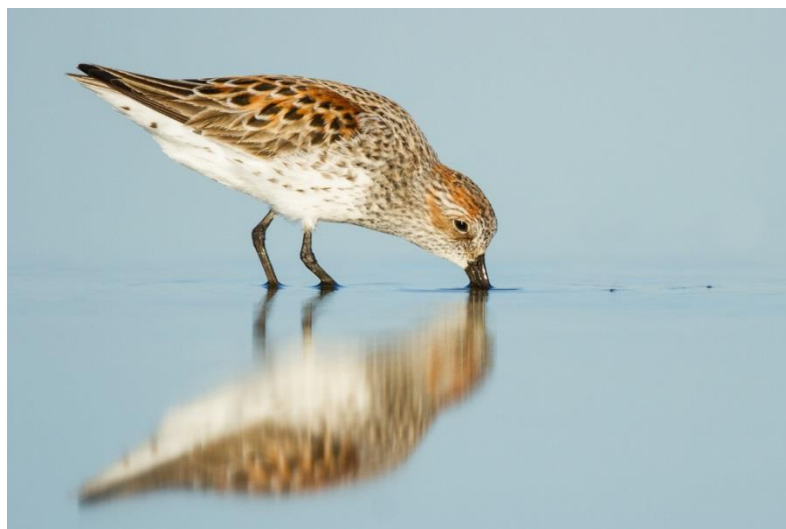
Western Sandpiper.

To support regional-scale protected areas planning, I developed a species distribution model (SDM) for these species. I first evaluated 128 published SDM algorithms, finding that a majority did not accurately report model uncertainty, prediction metric, or both. To aid conservation practitioners in selecting and reporting on SDMs for conservation, I developed a guide based on data type, conservation objective, and experience. I then modeled the population density of the three SAR in four national parks in New Brunswick and Nova Scotia, using Poisson log-linear regression models with a branching hierarchy. When comparing predicted population sizes to regional population estimates, national parks supported habitat for only 3-4% of Canada Warblers and 1-2% of Olive-sided Flycatchers. Thus it is highly unlikely that existing national parks alone are able to maintain viable regional populations. To help prevent extirpation of these species, forestry prescriptions need to be adjusted to conserve habitat, and key locations for management should be identified at a regional scale.