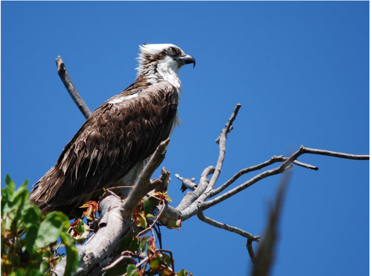
Osprey / balbuzard pêcheur.

Bulletin of the Society of Canadian Ornithologists • Bulletin de la Société des Ornithologistes du Canada